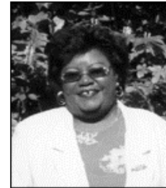
Words of encouragement from the president.